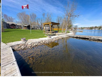
Armour Stone retaining wall