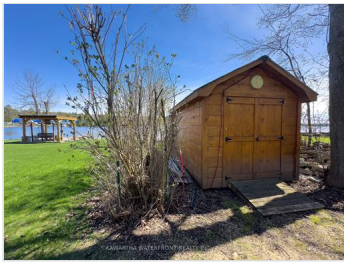
Water Side Shed