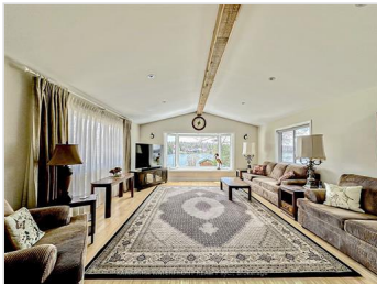
Main Level Living Room