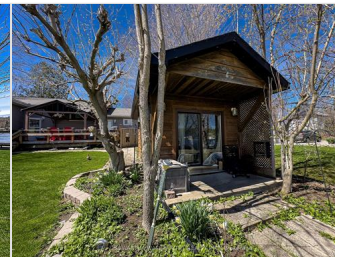
Bunkie - Finished with Pine Ceilings