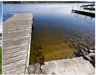
Steps in to the water