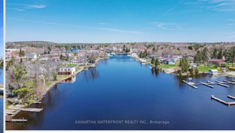
Looking towards Coboconk