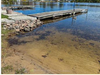
Sandy Wade in Area