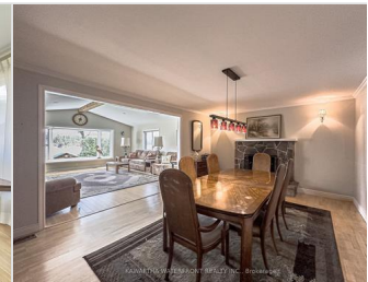
Dining Room with Fireplace