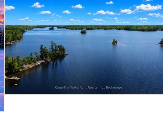
Winter on Shadow Lake