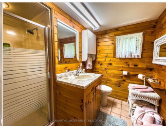
Lower 3 Piece Bath