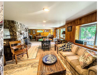
Lower Family Room