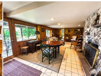
Lower with Wood Fireplace