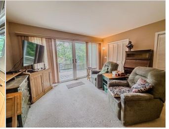
Main Den/Primary Bedroom