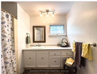
Main 4 Piece Bath