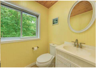
2 Piece Bath