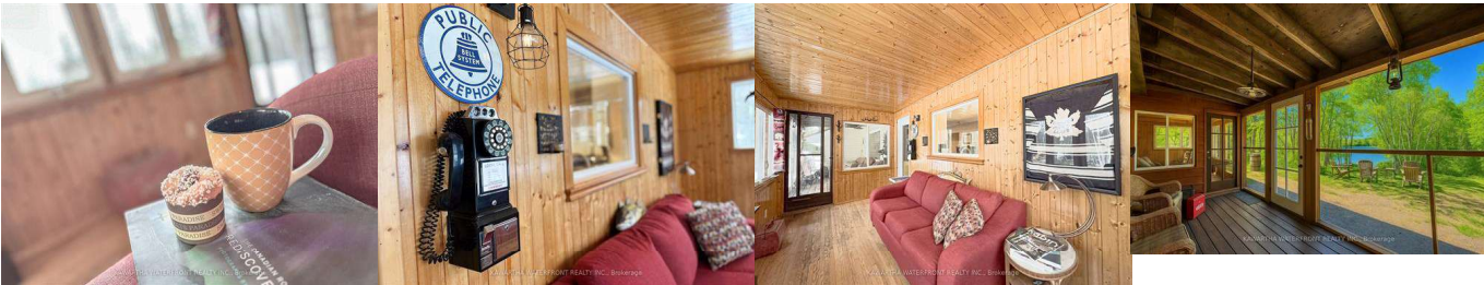
Three Season Sitting Ro