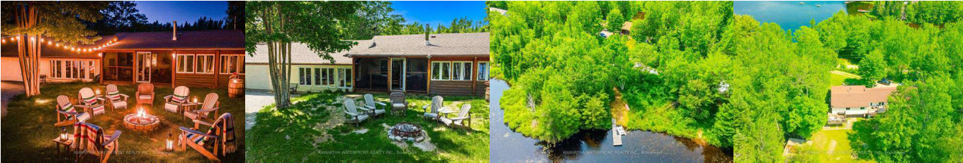
AI Enhanced Image

MLS® #: X12328545 1170 English Circle, Highlands East, Ontario K0M 1R0