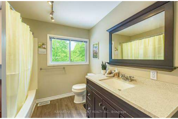
4 Piece Bath