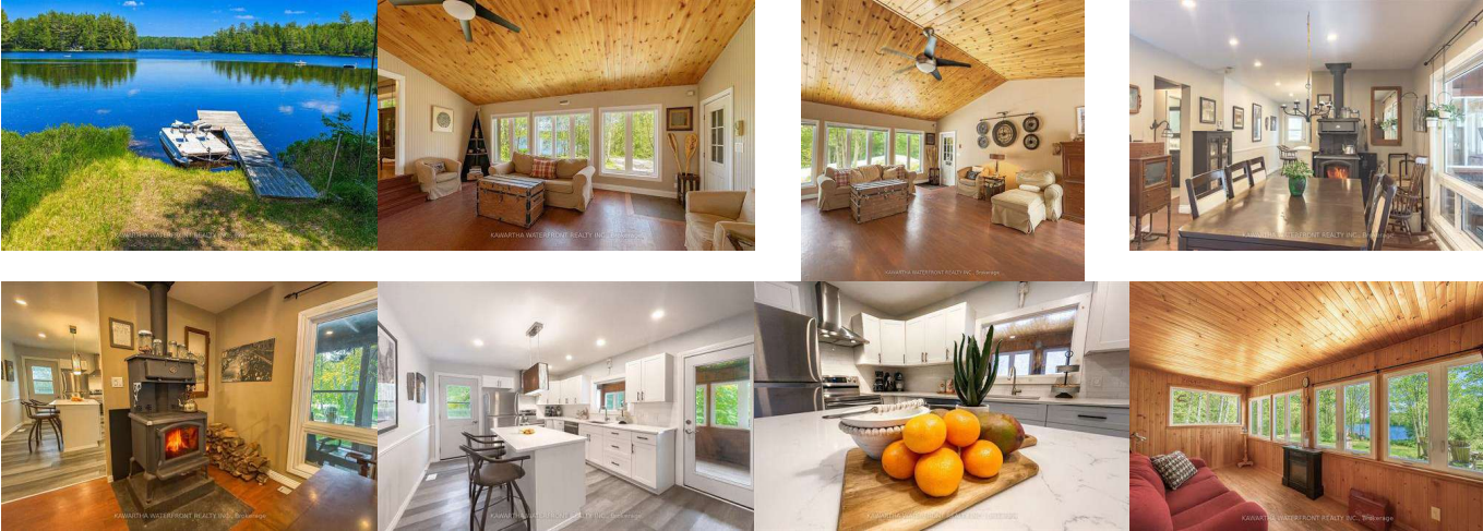
Three Season Room